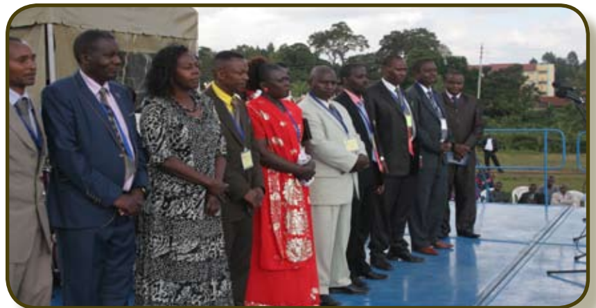
Karatina Church leaders.