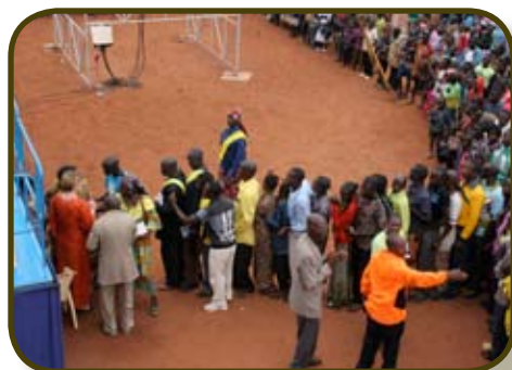
Lining up for Bibles

The response to Gods word was very good, When people began to understand Christianity was not just a long list of rules, “You shall not.” Rather a relationship with the living God, which results in a life of righteousness Joy and Peace. Many hardened hearts came forward and surrendered to Jesus.