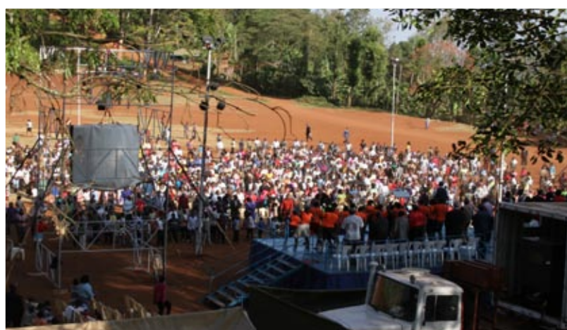
Mukurwe-ini Kenya 23nd -27th September 2015